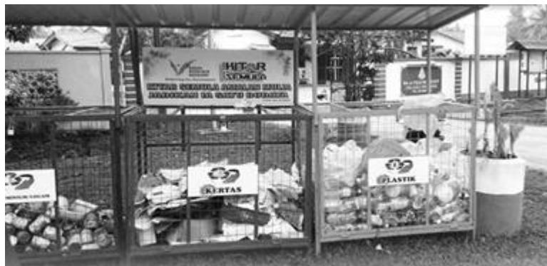
Figure 1. 3R Cage.

Until now, the separation process of waste that people perform in the household is manually, but the waste separation process in the recovery company is done by using a semi-automatic process. In the recovery company they use a conveyor machine, but still need employees to separate the waste into plastic, paper, and tin containers. Using the semi-automatic system, they also divide plastic and paper into some further categories. Plastics can be divided into PET, HDPE, LDPE, PVC, and mixed plastic. Papers are divided into A4, black and white paper, newspaper, and mixed paper.