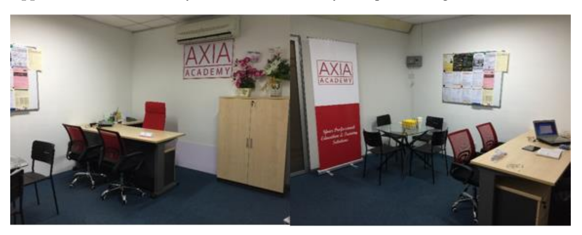
Appendix B: AASB Berjaya Time Square Roadshow, Kuala Lumpur.

Appendix A: Axia Academy Sdn Bhd (AASB), Bayan Lepas, Penang.