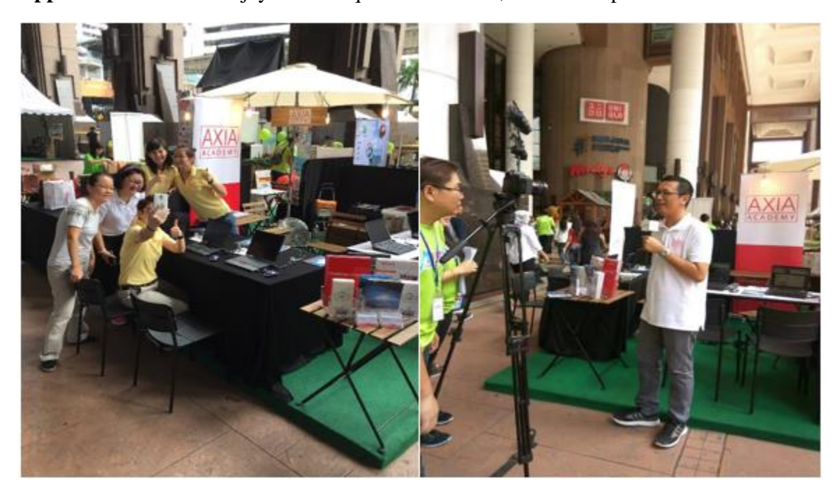
Appendix C: AASB Training Session, Bayan Lepas, Penang.